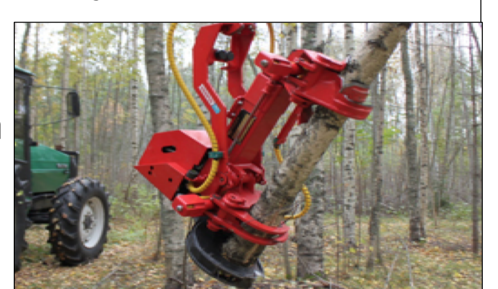
Naarva S23 stroke harvester