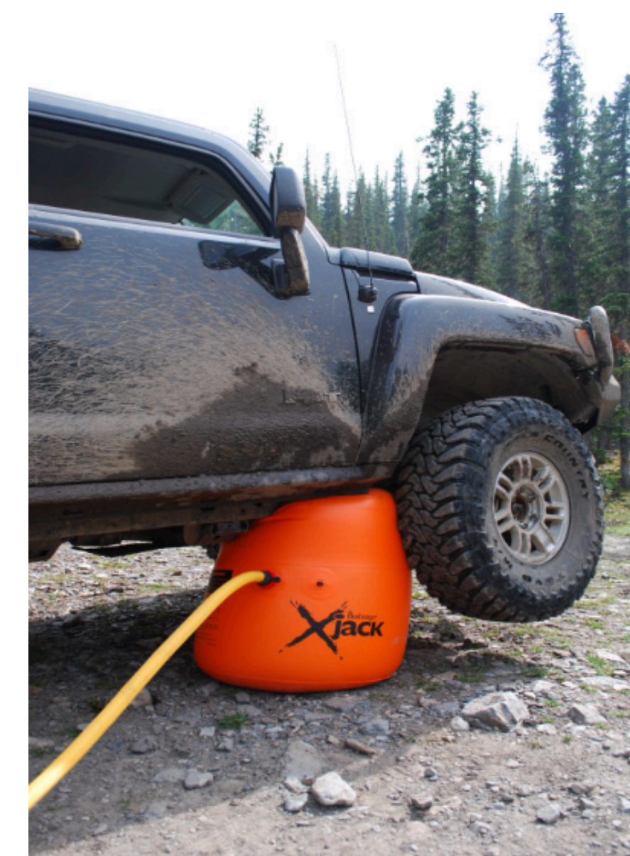
Bushranger Air Jack in action