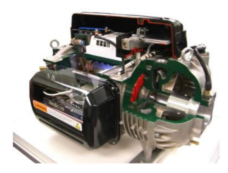
Figure 1. Verdicorp Cutaway Turbo Expander [1]

As explained by Verdicorp, the system is described as a chiller running backwards, instead of using electrical energy to produce cooling, the organic rankine cycle takes heat from different sources and turn it into economical electrical energy [1]. This system is often used by companies who have significant waste heat and want to increase the efficiency of their systems. The heat sources vary from solar concentrators, waste engine heat, manufacturing processes, or even waste steam [2]. Compared to various other forms of waste heat electrical generation, Verdicorp's ORCs are unique in the fact that they do not depend on a stand-alone heat sources to power them, but are only fed with byproduct heat of another process. In this way the ORC is self-sufficient and only adds efficiency and a reduction in thermal waste for a company. Although not implemented widely in the United States where energy costs are lower than other parts of the world, at around 12 cents per kWh, overseas the cost of electricity is around 18 to 20 cents per kWh [3]. With this system installed the monetary return on electricity alone can pay for the system in a few years.