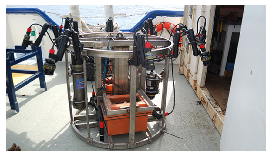
Figure 3: UM design

UM on the other hand has a cylindrical design, Figure 3, the first of its kind. Although this is a very different shape from those previously seen, its analysis could give insight on better potential options for the inside modeling of the equipment. The UM team also had more necessary data collecting equipment than the USF team, about the same number of pieces of equipment that the FSU group needs, from physical observations.