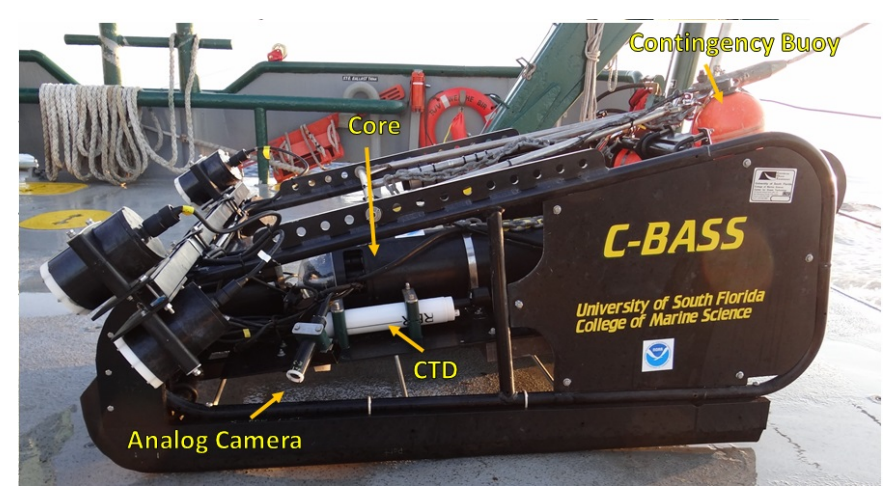
Figure 2: USF deisgn

USF has a small TOV called the C-BASS (The Camera-Based Assessment Survey System) which can be seen below in figure 2^2 . This smaller vehicle may require fewer parts which would make the vehicle lighter and easier to handle. Its shape and added surfaces may make a more hydrodynamic shape and aid in keeping the vehicle level while underwater. This vehicle is designed to withstand "up to 250 meters of water, but with modifications can be used much deeper"<sup>2</sup>.