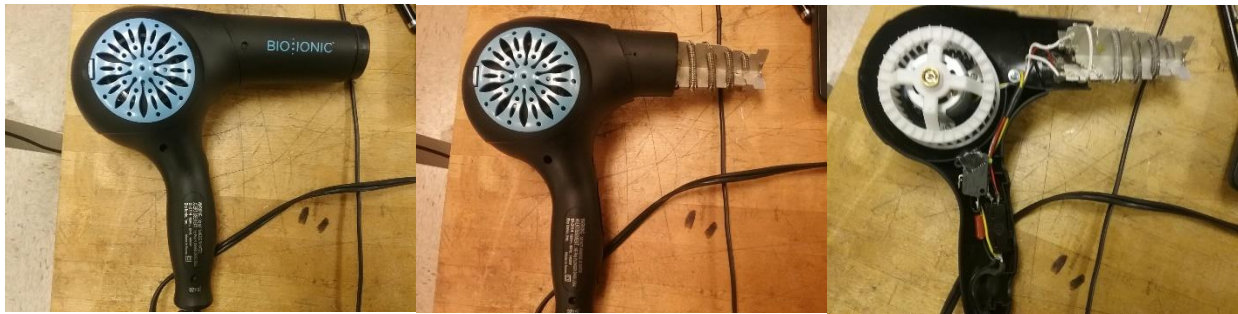
Figure 4: Stages of hairdryer casing removal

After purchasing the hairdryer and removing it from the box, the initial step is to rest the item on a flat surface (do not plug in hairdryer until process is complete). Next, acquire a small list of tools, such as a small Philips head screwdriver and a 0.5” flathead screwdriver. Once acquired, use the Philips head screwdriver to remove a few screws from the outer casing in order to slide the nozzle off of it, along with one half of the hairdryer’s outer shell; a transitional set of images of this process can be seen below (Figure 4).