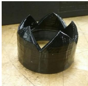
Figure 3: Chevron nozzle tip

The chevron nozzle is another product the group created for this project. It partially alleviates unwanted noise at the nozzle's exit by simplifying the mixing transition of the differed air velocities of the jet and the stationary air. The product contains 5 saw tooth-like edges, and the apparatus easily fits over the end of the nozzle's exit in a snug manner. An image of this product can be seen below (Figure 3) and further information regarding its measurements may be found in Appendix-A (Table 2).