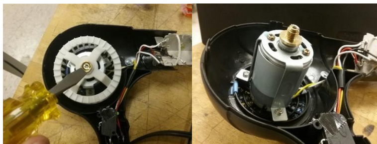
Figure 5: Stages of fan removal

Next, use the flathead screwdriver to remove the fan from the shaft of the motor. To do so, maintain firm control of the fan with one hand, and rotate the flat headed slot to the left in order to loosen the nut; the nut maintains contact between the motor shaft and the fan. The phases of this process can be seen ahead (Figure 5).