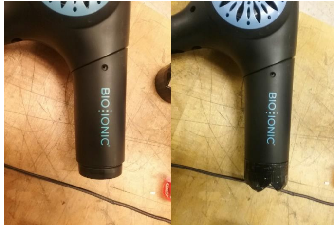
Figure 6: Images of the hairdryer without and with the chevron nozzle attached

After the fan is installed and the housing is securely fastened, it is time to install the chevron nozzle. There are no tools required for this section. All one would have to do is take the chevron nozzle and insert it over the end of the main nozzle of the hairdryer. This simple process can be seen below (Figure 6).