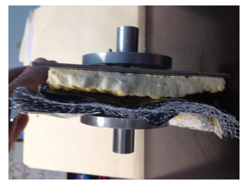
Figure 2: Layers of insulation currently in place on cryogenic tank

Magnetic coupling was introduced that may allow the placement of the motor outside the cryogenic tank. Magnetic couplings are generally used to transmit torque from one system to another where the magnetic transmission is required to maintain a hermetic seal to prevent leakage and contamination.<sup>[3]</sup> The magnetic coupling is used in this project to transmit rotational motion from the motor across the tank wall to a mixer/pump located