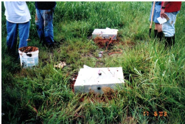
Fig.1 Measuring Flux at the Leon County Landfill

An additional survey of methane flux at the Leon County Landfill is also underway to verify values by other researchers. The methane flux is being measured by the flux method as shown in Fig.1.