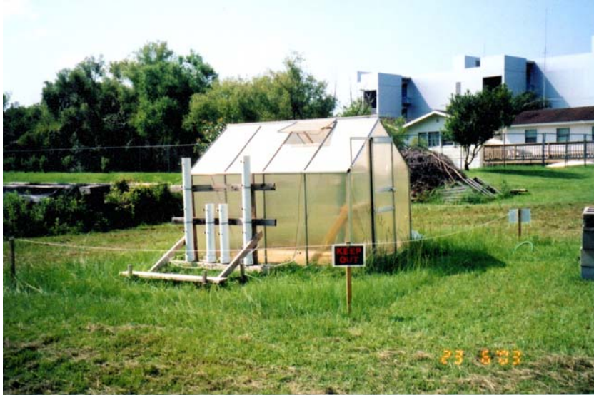
Fig.2 Photo of Columns with Methane Being Introduced at the bottom

Four columns were constructed so far. Soil from the Leon County Landfill was mixed with bio-solids from the Tallahassee Water Treatment Plant. Methane is being introduced at the bottom of four columns as shown in Fig.2